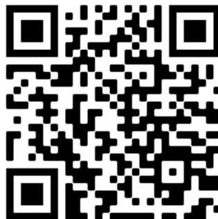
First-Year Student Guide online version